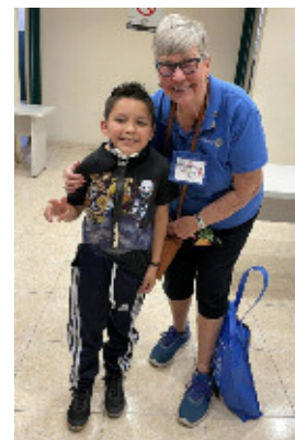
Above and left, Prepa 250 Escuela. Right, a child wearing a scoliosis vest.