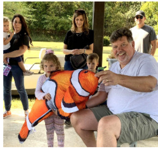
Table Rock Lake Rotary Conducts 5K Walk/Run