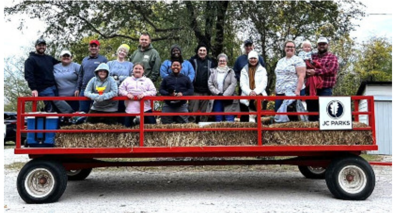
Jefferson City West Rotary Hayride

Jefferson City West Rotary wrapped up "Rotary Week" Oct. 15. They had a Visioning Session on Wednesday, their regular meeting on Friday, their annual hayride on Friday night, and park clean up with JCSWBA and Pack 6 Saturday.