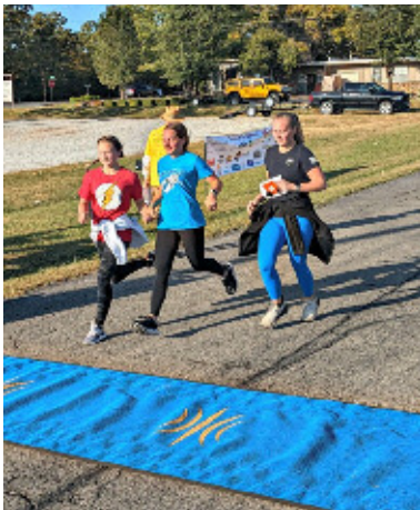
Oct. 15 event benefits Rotary nonprofit grant program