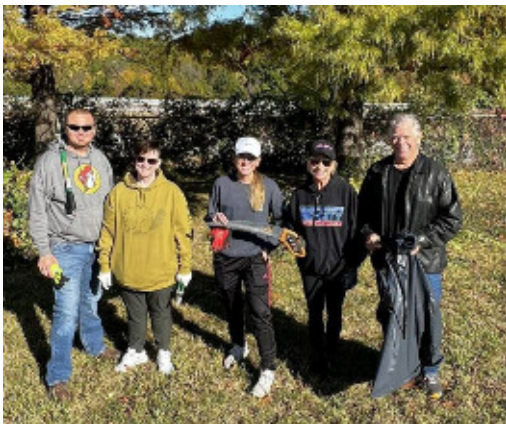
Park clean up with JCSWBA and Pack 6