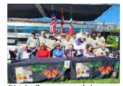
District Governors or their representatives from Districts 6040, 6060, 6080 and 5710 sign an Operation Pollination proclamation during the event.

District 6080 as District Governor Nominee.