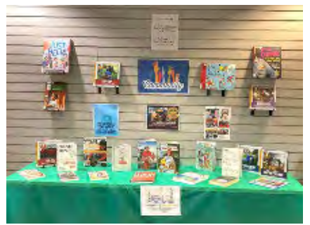
A month-long display at the Fulton Public Library promotes volunteerism and service as part of Fulton Rotary's Literacy Month activities during September.

The Rotary Club of Fulton celebrated Literacy Month with a display of books promoting service and volunteerism at the Fulton Public Library. Members also collected books for Head Start and took turns reading to the children there.