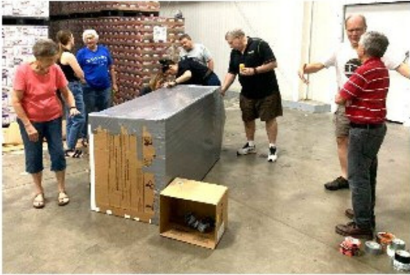
Jeff City Breakfast Rotarians hard at work