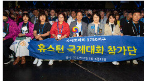
An RI Convention demonstrates how international Rotary International really is.