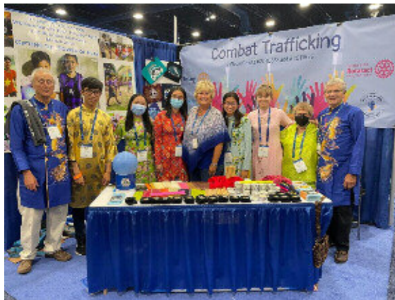
Fighting back against sex slavery in Vietnam