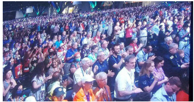
Rotarians at a general session in Houston