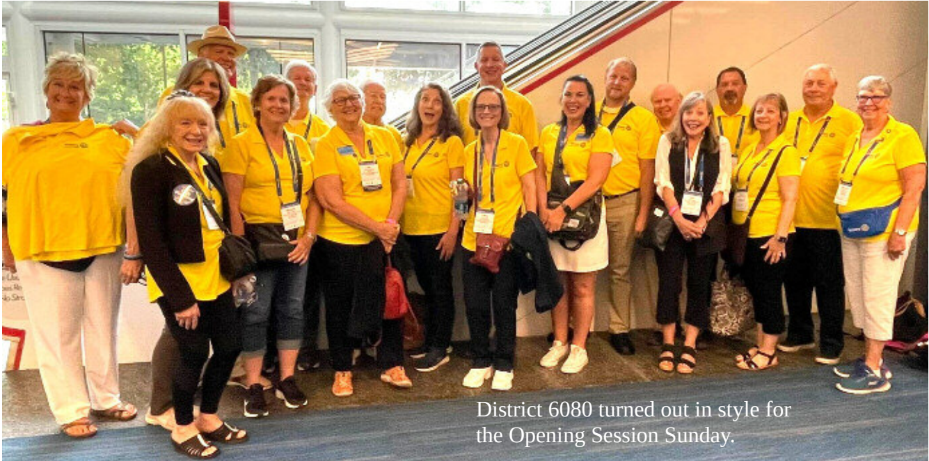
District 6080 turned out in style for the Opening Session Sunday.