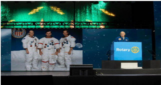
Former astronaut Charlie Duke, who walked on the moon