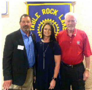
Table Rock Rotary Club