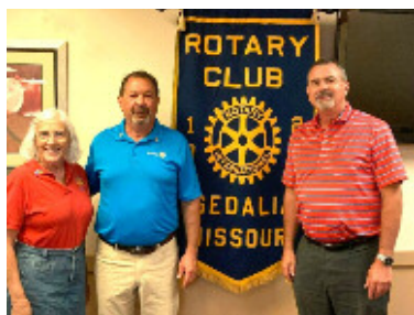
Sedalia Rotary Club, 101 years of Service Above Self