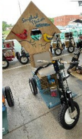
Songbird Station's cart