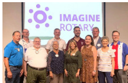
Branson-Hollister Rotary Club