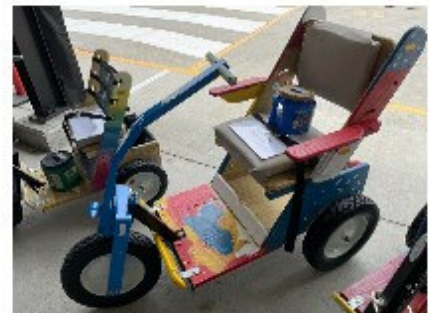
Columbia Rotary's cart