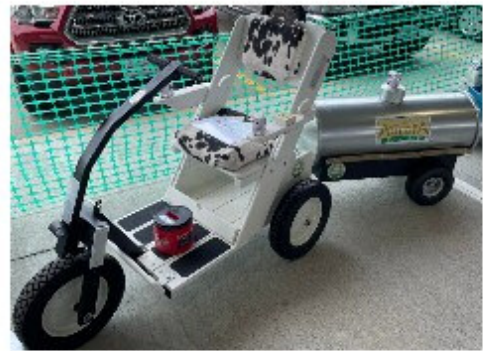
Aurora Organic Dairy's cart

Columbia Rotaract's fundraiser for Mobility Worldwide on July 17 at the MU Healthcare Pavilion was a huge success, with 115 carts entered and around 500 people in attendance. The event netted $86,065. Carts were entered by several Rotary clubs and numerous businesses. The People's Choice cart winner by voting was the Marceline United Methodist Women Orpha Circle. The Rotaract Choice was Aurora Organic Dairy. Mobility Worldwide sends the carts to victims of polio and landmines in third-world countries.