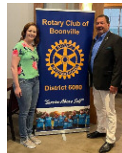
Boonville Rotary Club

See the District Governor 2022-2023 Club Visit Schedule. Go to: https://rotary6080.org/district-governor/district-governor-club-visit-schedule/