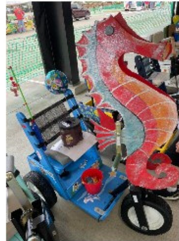
Another interesting cart design