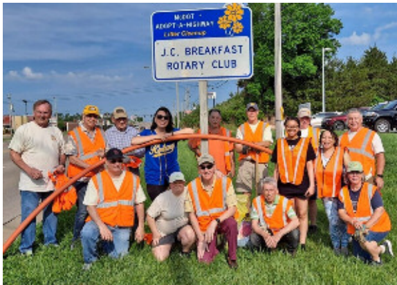
Jeff City Breakfast Rotarians gather for a photo.

The Jefferson City Breakfast Rotary Club gathered May 14 to pick up trash along Missouri Boulevard.