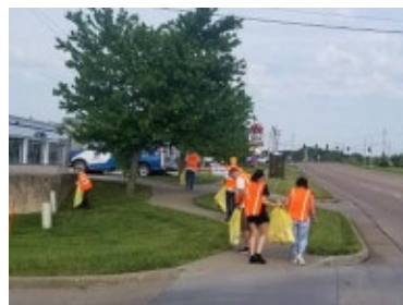
Hard at work!