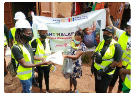
They distributed 150 mosquito nets to disadvantaged, vulnerable people.