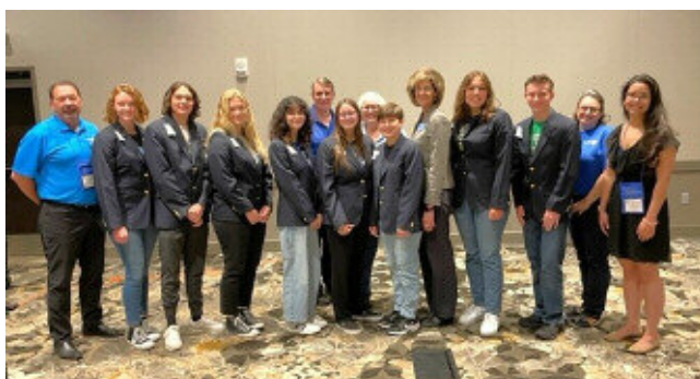
District and RYE leadership with outbound students