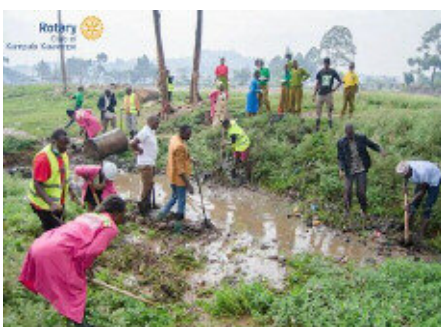
They removed stagnant water so that water can flow freely.

In our club meeting we agreed that Rotaract, Interact and Rotakids will take up now that sanitation part so that they are also significant and involved in the project. So under their now "Keep Kawempe clean campaign" will lead us in mobilizing the community in further simple clean ups and education on malaria prevention, garbage management and maintaining good sanitation, starting this coming weekend. We are in for our second phase which will be in April before our district conference.