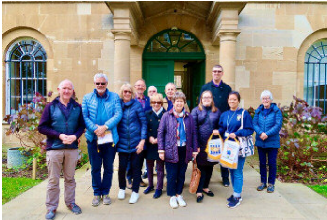
The second St Peter's College tour group of Rotarians on March 20.

Saturday was full of interesting plenary sessions, and we even got to hear from Dame Sarah Catherine Gilbert who helped develop the Oxford/AstraZeneca vaccine.