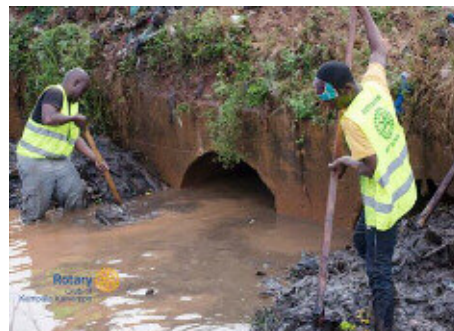
They cleared drainage channels.