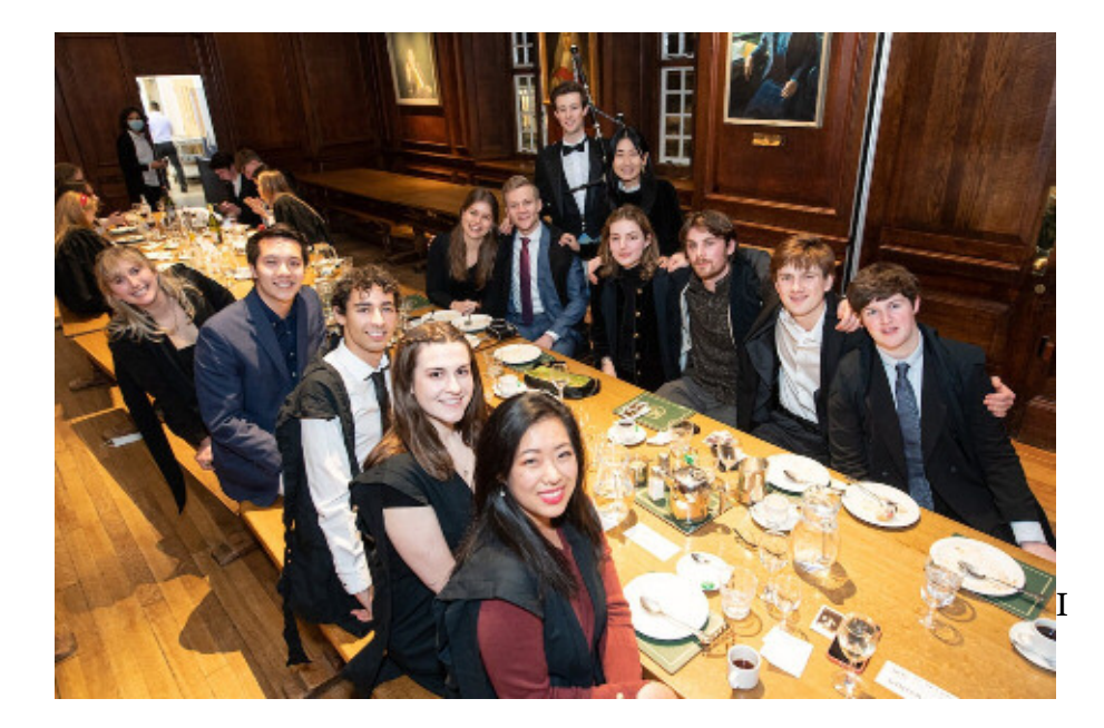
With friends at St. Peter's College to celebrate Burns Night on January 25, 2022.

I attended the formal with a group a friends to support one of our friends who played the bagpipe not only to welcome in members of the high table (which usually seats the Master of our college and other members of faculty), but to also accompany the presentation of the haggis. My friend also piped for the exit of the high table as the entire hall sang Auld Lang Syne. To have music, speeches, recitations, and group singing during our formal dinner was certainly a special treat.