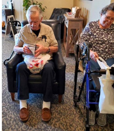
Above: Jefferson City Breakfast Rotary members prepare goody bags.

Left: Area nursing home residents open their Valentine's Day goody bags.