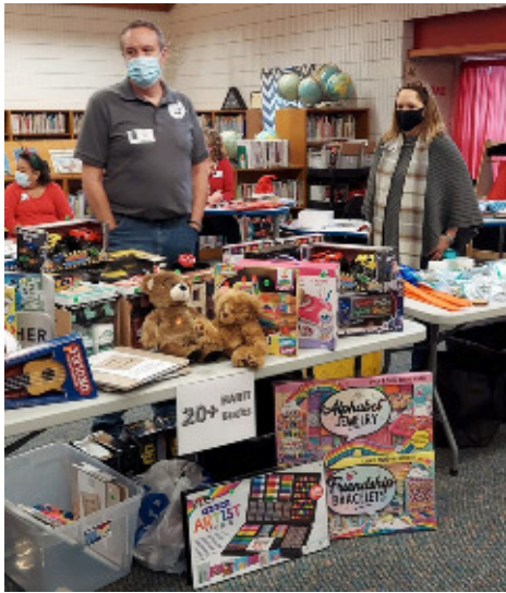
Springfield Metro Rotary at the Christmas store for students at McGregor Elementary School.

The students McGregor Elementary School, a Title 1 school in Springfield, earn points (dollars) each week based on how they act (their “HABITS”). HABIT stands for Homework, Attendance, Behaviors, Initiative and Traveling. Springfield Metro Rotary sets up a store each month (funded by the club) for the kids to shop with their dollars. Products range from toys, books, gift items, to snacks, toilet paper, and other toiletry items.