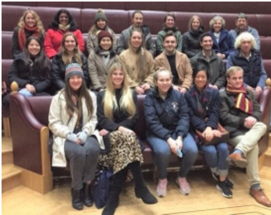
Rotary Trip to Windsor and Eton on Nov. 20

Eight-week terms really go by fast; especially coming from the University of Missouri's 16-week semesters, I feel like I still have so much work to do even after submitting a few final assignments. To be fair, we are still expected to work during the six-week term break (or as they call it, a vacation), we just don't have scheduled classes. My final exams are also the Friday before the start of the term break (Jan. 14), so I'll be spending this vacation catching up on readings and reviewing material to successfully close out Michaelmas (the first term) before starting Hilary (the second term).