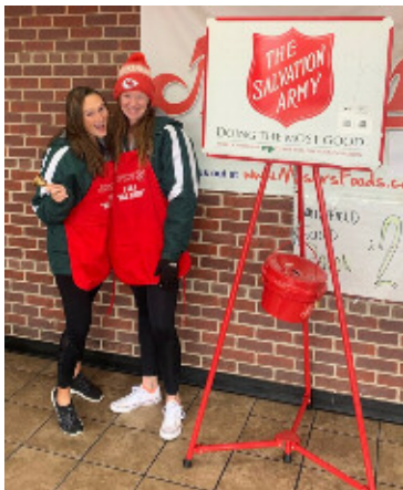
William Woods University Rotaract members have fun ringing bells.