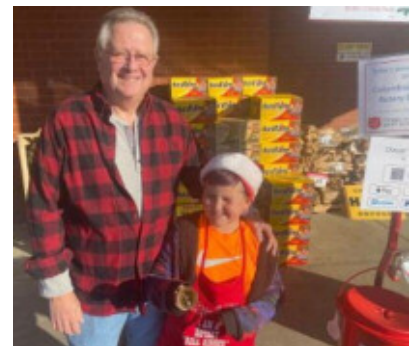
Columbia South Rotarians ring bells for the Salvation Army