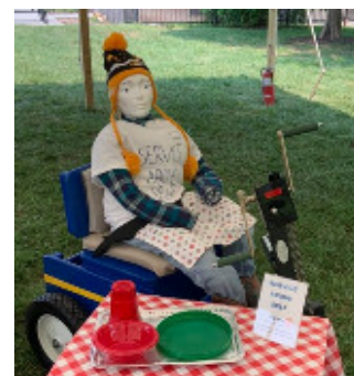
Columbia South Rotary's cart.