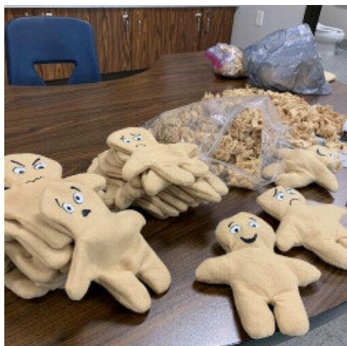
"Feeling Buddies" being prepared by Columbia Public Schools and community partners. These Gingerbread Men-like dolls allow Title 1 preschool students to better express how they feel to their parents and teachers.

Over 600 preschool children and their families were positively impacted by this project. Metro Rotary contributed $3,400 towards the project, which was matched by a District Simplified Grant.