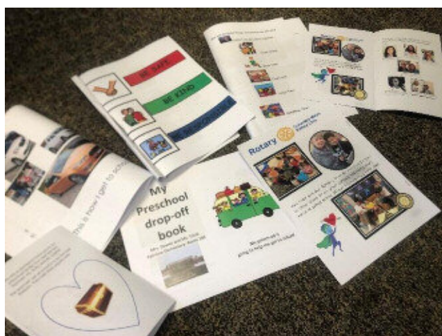
Each incoming Title 1 preschool student receives a book that informs them of classroom procedures such as arrival or dismissal, how to walk safely in the hallways, or how we work together as a family.