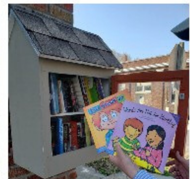
More books for Little Free Libraries