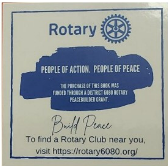
Bookplates acknowledge the donation from District 6080 Rotary clubs.