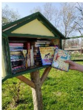
Books for Little Free Libraries in Rocheport

Participating clubs also received books to place throughout their communities in "Little Free Libraries." Those clubs included Columbia Metro, Fulton, and Sunrise Southwest/Rocheport in the DBRL system; Springfield Sunrise, Pulaski County, Laurie Sunrise Beach, and Jefferson City Breakfast.