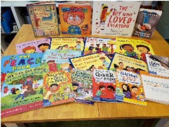
Some of the many books promoting conflict resolution, kindness, and other components of peace