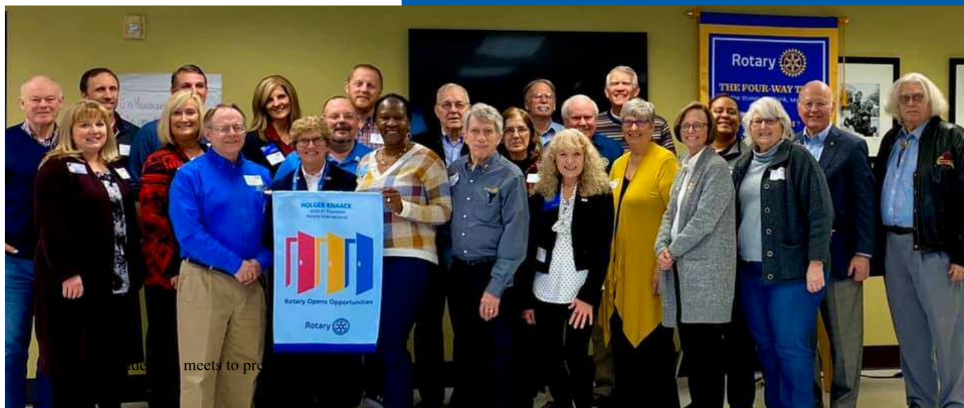
District leadership meets to prepare for coming year.