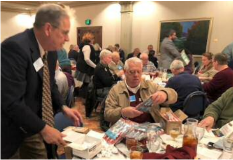
Rotary Club of Springfield all-club service project making packages for Jordan Valley Community Health Center.

Months after the Rotary Club of Springfield helped fund a mobile dental unit for Jordan Valley Community Health Center, club members returned to their favorite project with a $21,000 gift that provided supplies to enhance the dental care Jordan Valley delivers to low-income Ozarkers.