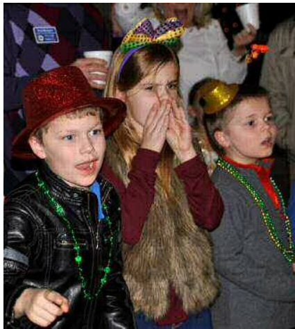
Young spectators react as mice near the finish line.

All bets were on the mice, but various local charities, including the Super Sam Foundation, were the winners at the Rotary Club of Fulton's fundraiser Feb. 22. Approximately 175 people attended the sixth annual Callaway Cup Mouse Races at the Fulton Event Center.