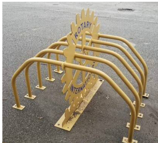
An idea to steal: a bike rack in Springdale, Arkansas, sponsored by Rotary. It's a service project that boosts the public image of Rotary.

will conduct its Magic Dragon Car Raffle drawing at 5 p.m. May 2 during the Magic Dragon Street meet nationals. This year they are raffling off a 2020 Camaro LT1. Tickets are $20 each with a maximum of 2,500 to be sold.