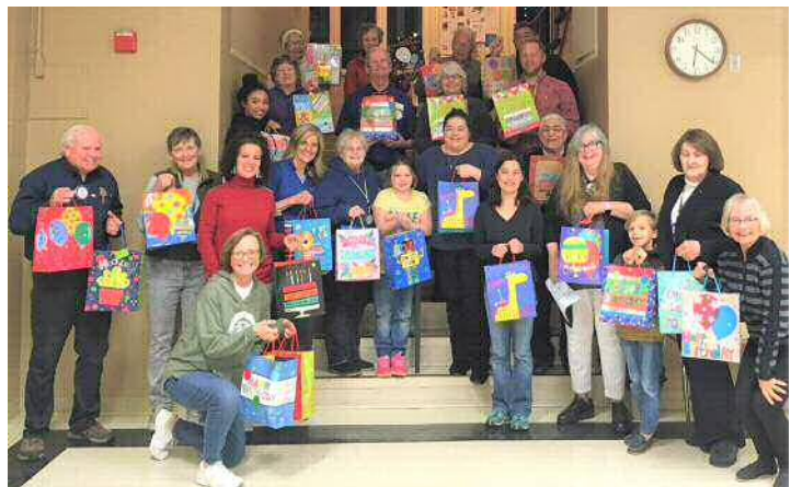
Jefferson City Evening Rotarians recently gathered to fill birthday bags for children under CASA (Court Appointed Special Advocates) care. This gathering marks the beginning of their second year of their birthday bag bash.