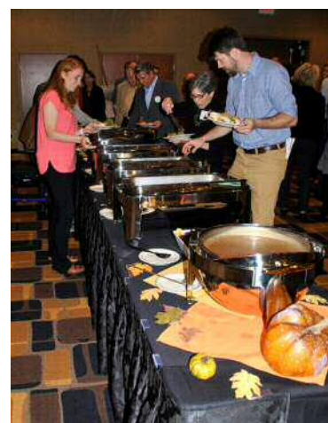
Rotarians go through the buffet line at Columbia's annual All-Rotary Thanksgiving Luncheon Nov. 26.

The Rolla Breakfast and the Noon clubs are sponsors for Lichternacht and Christlkindl Markt December 6 and 7, organized by the Rolla Area Sister City Association and built around communications with their Sister City, Sonderhausen, Germany. Lichternacht is the tree-lighting event that starts the Christmas season and Christlkindl Markt is the German food and entertainment event that follows Rolla's Christmas parade. They invite anyone from District 6080 to attend and enjoy the start of the Christmas holiday.