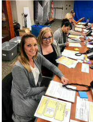
The Rotary Club of Springfield Metro helped out at the Children's Miracle Network Miracle Week Telethon at KY3.

The Rotary Club of Springfield Southeast honored veterans at their Nov. 7 meeting.