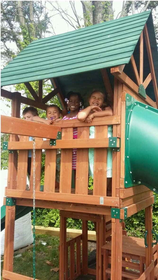
Children play in the St. Raymond's House playground.

The Rotary club of Columbia South expended nearly $7,000 to provide playground equipment and a perimeter fence at the St. Raymond's Society, a local shelter for single mothers and their children. Approximately 20 Rotarians spent nearly 150 man-hours constructing the play-structure, preparing the ground and covering with rubber mulch, constructing raised garden beds and filling with top-soil. Smiling children are a great reward.