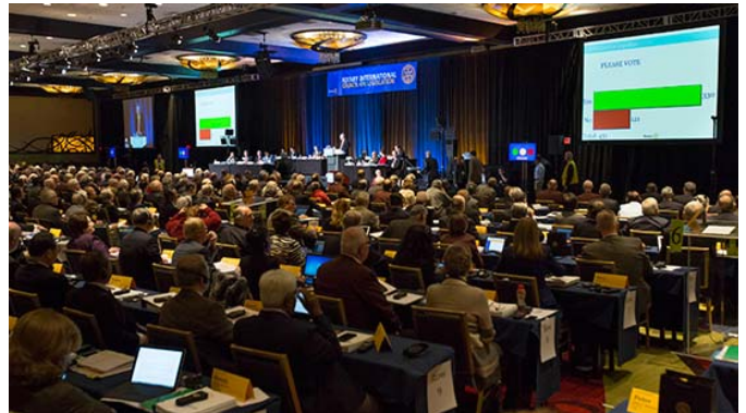
The Council chamber, with voting totals shown on the screens.