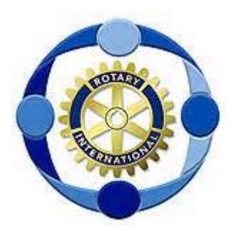
The Rotary Fellowships Logo