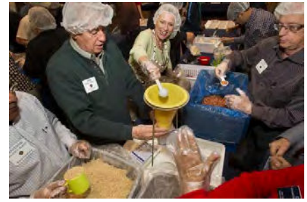
Through The Rotary Foundation we provide nutrition and sustenance to those who are lacking of both.

The primary thing that we do, when you sum it all up, is that we provide hope.