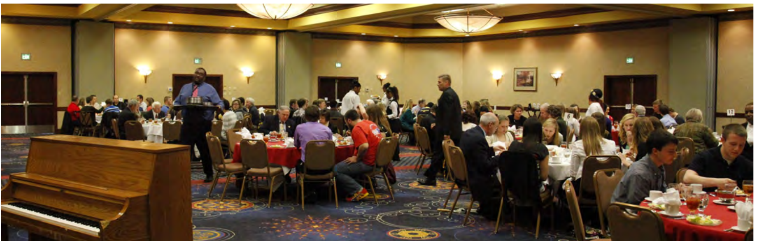
Students having luncheon fellowship with Rotarians