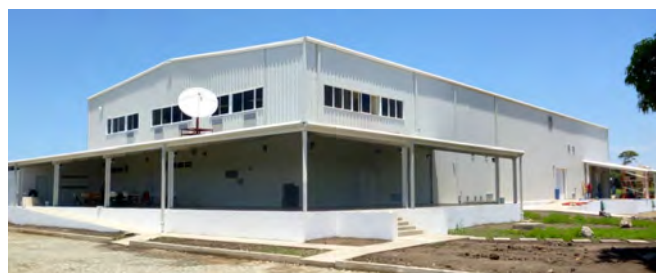
New Medika Mamba manufacturing facility

Meds & Food for Kids remains deeply grateful for the early endorsement of Rotarians and it is with continued partnership that MFK looks forward to saving more lives and growing brighter opportunity for Haiti's families.