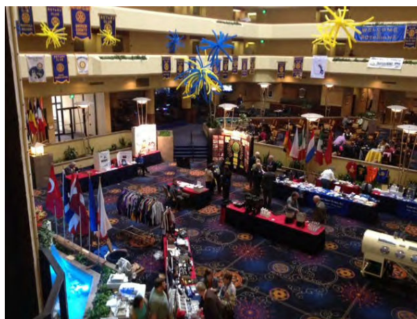
The lobby of the Capital Plaza Hotel