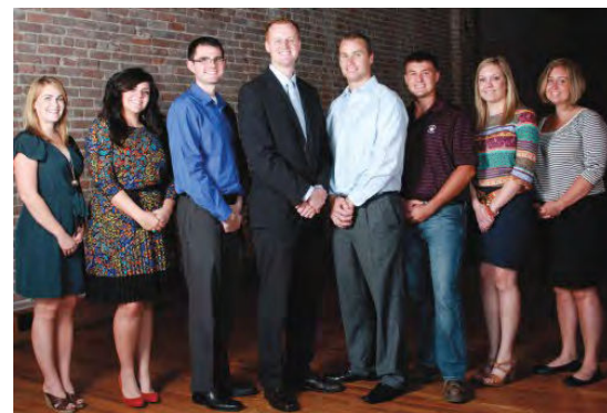
Rotaract Club of Springfield

The Rotaract Club of Springfield is always on the lookout for ways to reach out to those in need. Whether helping the Boys & Girls Town of Missouri get ready to go back to school, planning the kid's annual Halloween party or fundraising through special events such as the annual Casino Night, members are constantly finding ways to live their mission of Rotary. The Club supports local youth by donating time and money each year to Boys & Girls Town and other area charities. They perform one community service project every month.