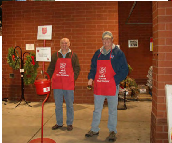
Above: Columbia South's Bell Ringing Project where 54 Rotarians and 12 non Rotarians contributed 138 hours of community service by ringing bells to solicit contributions for the Salvation Army.