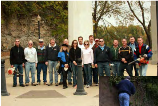
Below: Jefferson City West Rotary Club cleans up Rotary Park

District 6080 completed the first half of the Rotary year with numerous community service activities around the state. Nineteen different clubs have reported activities involving 761 individuals and 2,478 service hours! What a great way to live up to our mottos of "Service Above Self" and "Peace Through Service" We thank the clubs for their involvement and for making their communities a better place. The details of the activities reported can be found on the Rotary District 6080 website at http://www.rotary6080.org/district-6080-community-service-projects/ .