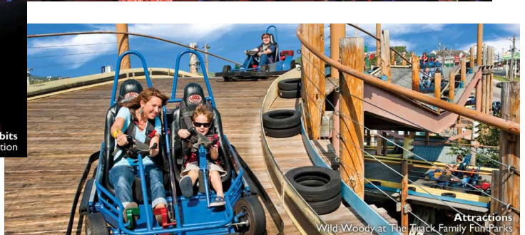
Attractions Wild Woody at The Track Family Fun-Parks