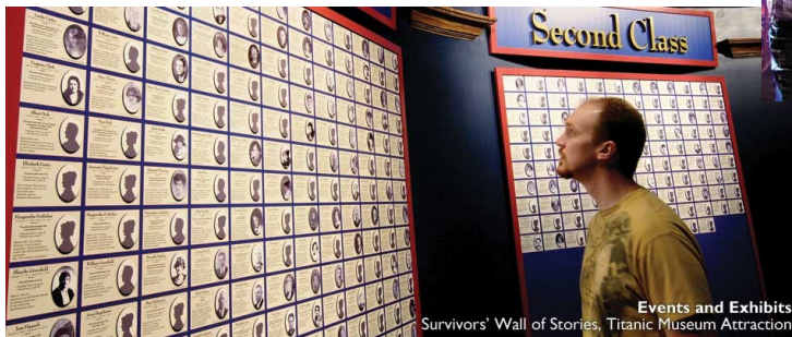
Events and Exhibits Survivors' Wall of Stories, Titanic Museum Attraction