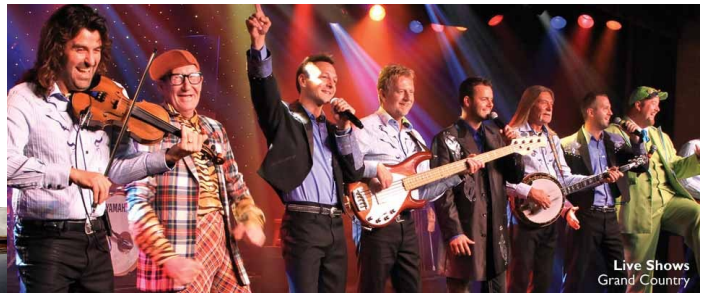
Live Shows Grand Country

Immediately following banquet Texas Hold 'Em and Blackjack tournament