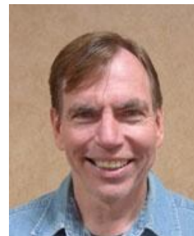
BY AG TERRY FURSTENAU

Literacy work is urgently needed. Extensive government studies show that 21% to 23% of adult Americans are not "able to locate information in